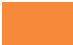
Calendula B78w / A230-A