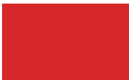
Red Barron C58w / I040-A