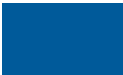
Tartan Blue E27w / C230-D