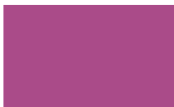
Rich Velvet D36w / A070-A