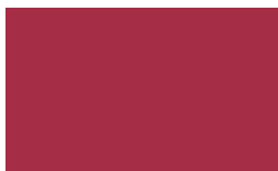
Heart C71w / I030-B