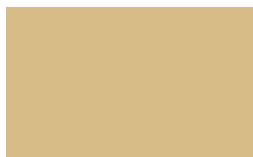
Honey Tree A53w / J040-B